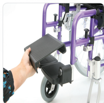
One piece footplate cover, removable.