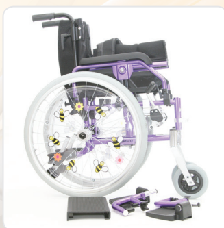
Easy fold away with removable footrests.