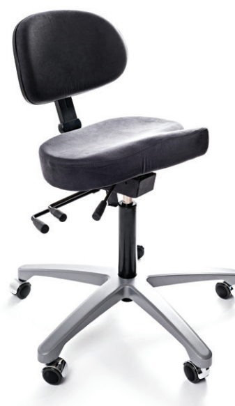
S10 Standing support chair 18 cm gas lift