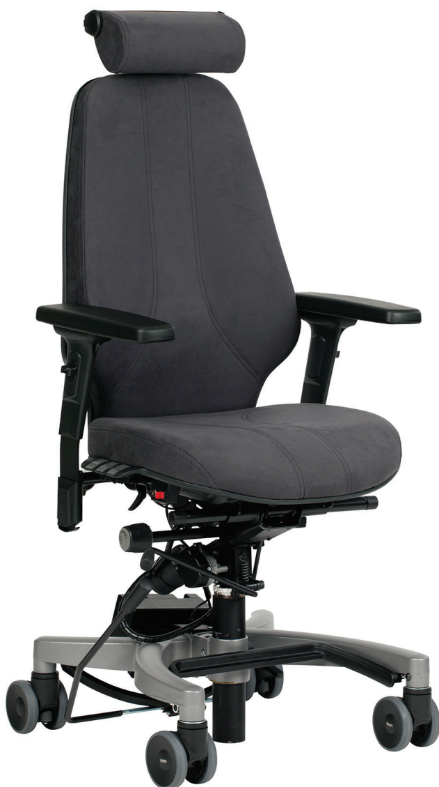
Fabric: Comfort 0049

The unique feature of our Tilto models is the tilt function which contributes to variation and movement. When working, it is easy to end up in a forward-leaning, static sitting position that results in impaired circulation. With the tilt function in open position, the chair follows the body's movements all the way back to a relaxed sitting position which opens the airways, stretches the upper body and provides good circulation. Movement adds to variation, relieving pressure on vulnerable pressure points and aiding good blood circulation to the pelvis, hips and thighs.