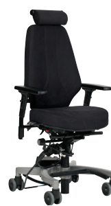
Tilto E2 24/7

Tilto E2 24/7 for extended periods in sitting position. The 24/7 model is supplied with extra cushioning and breathable fabric options so that you can sit in comfort for long periods. The tilt function provides movement options.