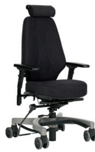
Tilto G2 24/7

Tilto G2 24/7 for extended periods in sitting position. The 24/7 model is supplied with extra cushioning and breathable fabric options so that you can sit in comfort for long periods. The tilt function provides movement options.