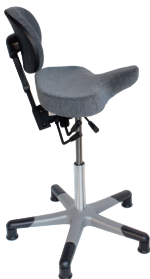
S1 Standing support chair 18 cm gas lift

Choose from models with stable sliders or models with wheels, with or without load operated brakes, which permit mobility for work involving a lot of movement. Hepro also offers standing support chair accessories for special requirements.