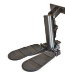
Telescopic foot support, divided footplate