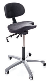
S1 Stand support

Standing support chairs with manual regulation for standing work. The chairs provide good support with manual adjustment options for seat height, seat tilt and back-rest angle.