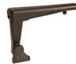
Armrest Comfort for workchair and coxit chair