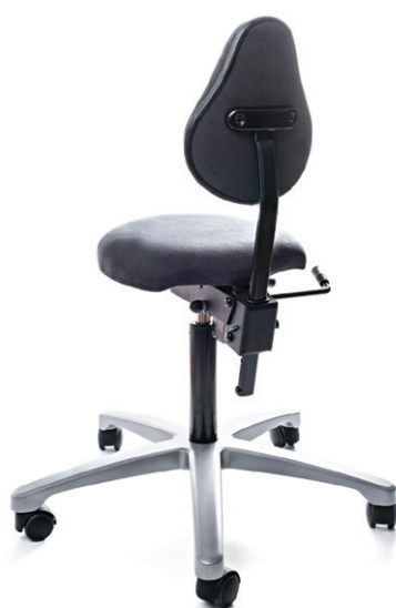
S9 Standing support chair 18 cm gas lift