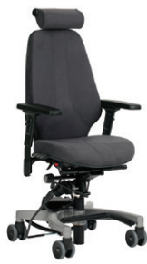
E2 Tilto EHR

Work chair with electric seat lift and tilt. This model is specially designed for users who spend a lot of time sitting in their work chair. The unique feature of our Tilto models is the tilt function which contributes to variation and movement.