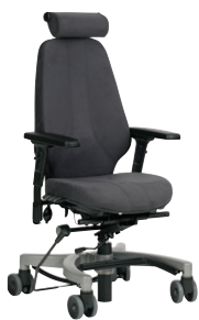
G2 Tilto EHR

Work chair with manual seat lift and tilt. This model is specially designed for users who spend a lot of time sitting in their work chair. The unique feature of our Tilto models is the tilt function which contributes to variation and movement.