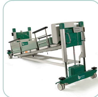
Trendelenburg/ Reverse Trendelenburg