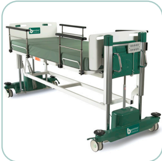
12cm - 82cm (4.7" - 32.3") height range

The deprimo floor level bed has been developed to significantly reduce the risk of injury to vulnerable patients who are prone to falling out of bed, increasing patient safety and reducing the costs of in-hospital injury.