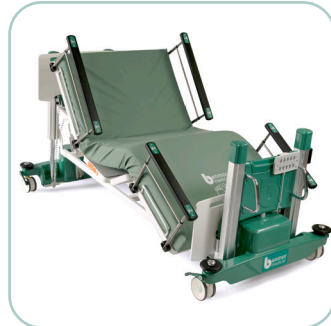
Fully articulating bed