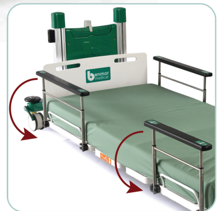
Stowable safety rails concealed within the mattress platform