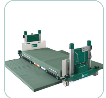
Crash mats available for additional safety

The average hospital stay for patients who fall is 12.3 days longer